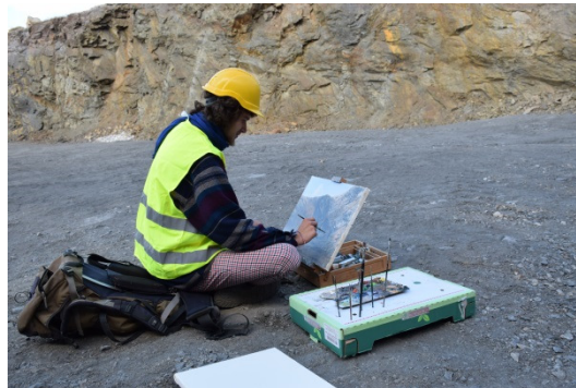
Fig. 37. The Iron Mountains Geopark lives!