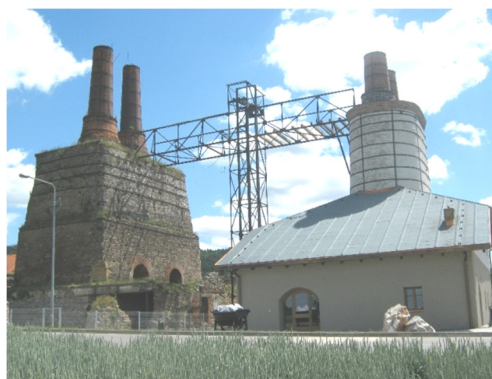
Fig. 35. Berl lime kiln with preserved historic furnace.

Renovated lime kiln in Závratec at Třemošnice attracts with the exhibition on lime industry in the Iron Mountains. It is a valuable technical and cultural monument, a rarity in Europe - 150 years old lime production plant. There was a 5 km long cableway leading to the lime plant, one of the longest in Bohemia (Fig. 35.).