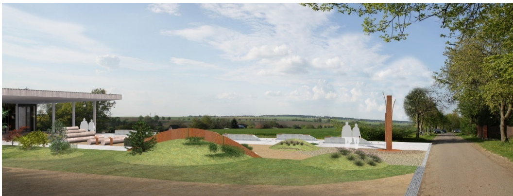
Fig. 36. VNC Podhůra

This visitor center will be located in the area of Podhůra Recreational forests - in the foothills of the Iron Mountains, near Chrudim – the seat of the Iron Mountains Geopark. This will be the northern gateway to the Geopark. The center will include the year-round open outdoor exhibition, which will inform visitors about the geological history of the Iron Mountains as well as the work of foresters and plants and habitats typical of this region. The project will be implemented in collaboration with local partners and used by the town of Chrudim, PLA the Iron Mountains and the Iron Mountains Geopark (Fig. 36.).