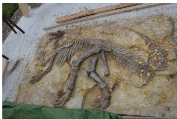
Fig. 34. Pasička. The wall stone geological map and the model skeleton of dinosaur, genus Iguanodon found in the vicinity of the Iron Mountains.