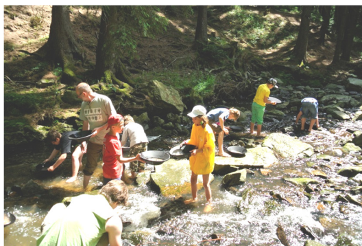
Fig. 32. Educational trail along the valley of Doubrava.

An easy trail leading from Prachovice to Vápenný Podol offers some insights into the limestone quarry, along with the information on the history and geology of this site.