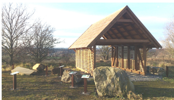
Fig. 33. Unattended information stand in Štěpánov u Skutče themed for Mesozoic

The geology of Heřmanův Městec sub-region is generally presented in the exhibition located behind the local information center.